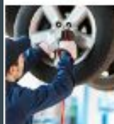
Auto Service Seaquam

Applications are due before spring break