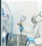
Auto Collision VCC