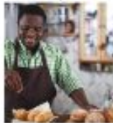
Baking & Pastry VCC