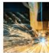
Metal Fabricator BCIT