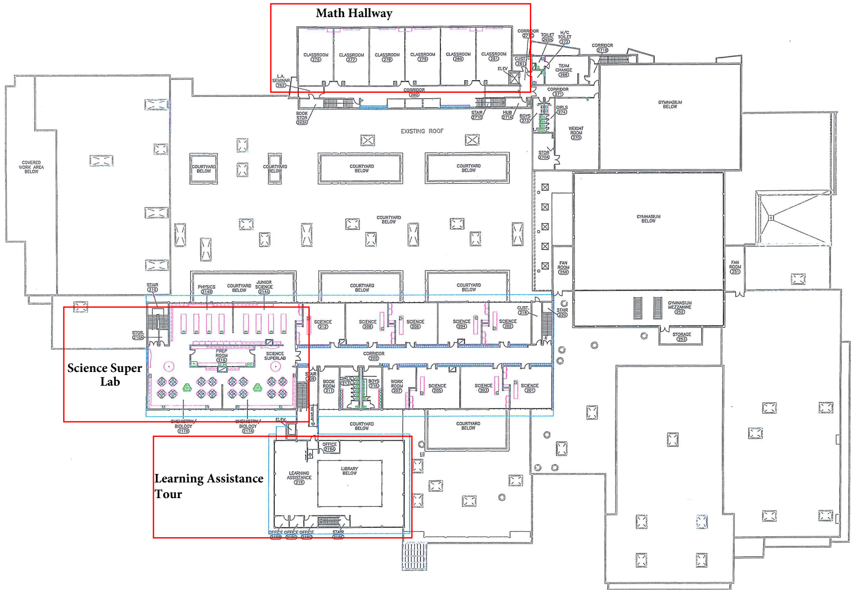
SOUTH DELTA SECONDARY SECOND FLOOR PLAN